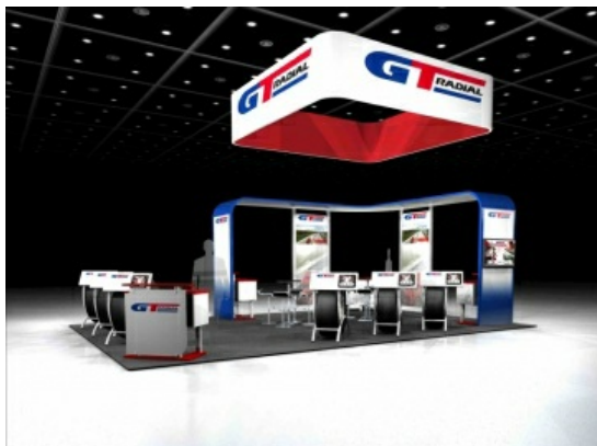
The new GT Radial booth will make its debut at the Mid America Trucking Show in March.