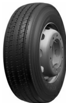
GT Radial GT979 FS

Verification by the Environmental Protection Agency's SmartWay Program means that the products comply with federal requirements for rolling resistance. SmartWay truck tires provide an estimated fuel savings of three percent or greater against market leading on-highway commercial truck tires.