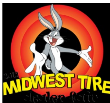
Popular cartoon characters played a role in the Midwest Tire