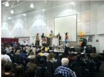
More than 750 dealers attended the Midwest Tire 2012 Dealer Fair, including this full house in Sioux Falls.